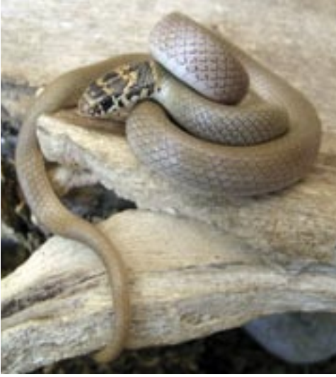
Fig. 2. Eirenis levantinus (ZDEU 199/2007, Nr.1) female, from Selvili Tepe (=Kornos), N. Cyprus.