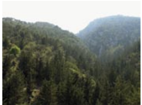
Fig. 4. Biotope of Selvili Tepe (Kyrenia Mountain Range), Lapethos-Kyrenia, N. Cyprus, 801 -938 m a.s.l.

substrate on limestone, enriched by organic wastes derived from the leaves of cypresses and terebinth trees. In the same area the following reptiles were also collected: Ophisops elegans schlueteri , Ablepharus budaki budaki , Trachylepis vittata , Macrovipera lebetina lebetina , Malpolon insignitus . At some distance, frogs of the Pelophylax ridibundus complex were seen in spring waters and man-made pools. According to our observations, Eirenis