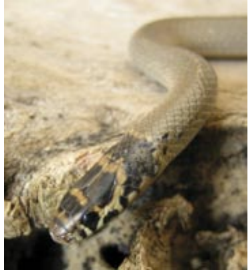
Fig. 3. Eirenis levantinus (ZDEU 199/2007, Nr.2) male, from Selvili Tepe (=Kornos), N. Cyprus.

prus), which was also observed by one of us (GÖÇMEN, in March 1997). This specimen was found in the westernmost part of the Kyrenia mountain range, the northern one of the two mountain ridges in Cyprus. Unfortunately, this specimen could not be collected. It escaped into a compact blackberry shrub within a rocky area (ca. 440 m a.s.l.), where rainwater was flowing. Since then, the same locality has been visited repeatedly, however without any success.