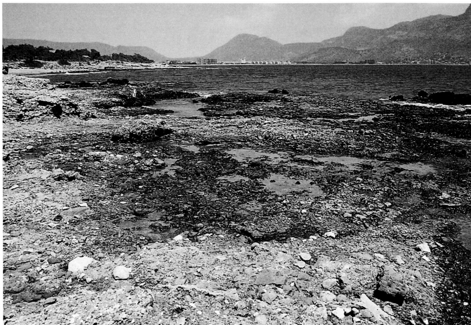
Fig. 2. Habitat of Lophyridia aphrodisia cypricola west of Yeşilovacık, Içel province.

coast, with a presumed northwestern distribution limit south of the Büyük Menderes delta. The more northerly İzmir region is a well known northern distribution limit for various Mediterranean faunal elements (tiger beetles: Megacephala euphratica [FRANZEN 2001] and Lophyridia concolor [FRANZEN 1999]). Since rocky seashore habitats predominate along the western and central Mediterranean coastal stretch, the distribution may be more or less continuous there. However, most of these areas are almost inaccessible to man and this may be the reason for the species' apparently fragmented distribution.