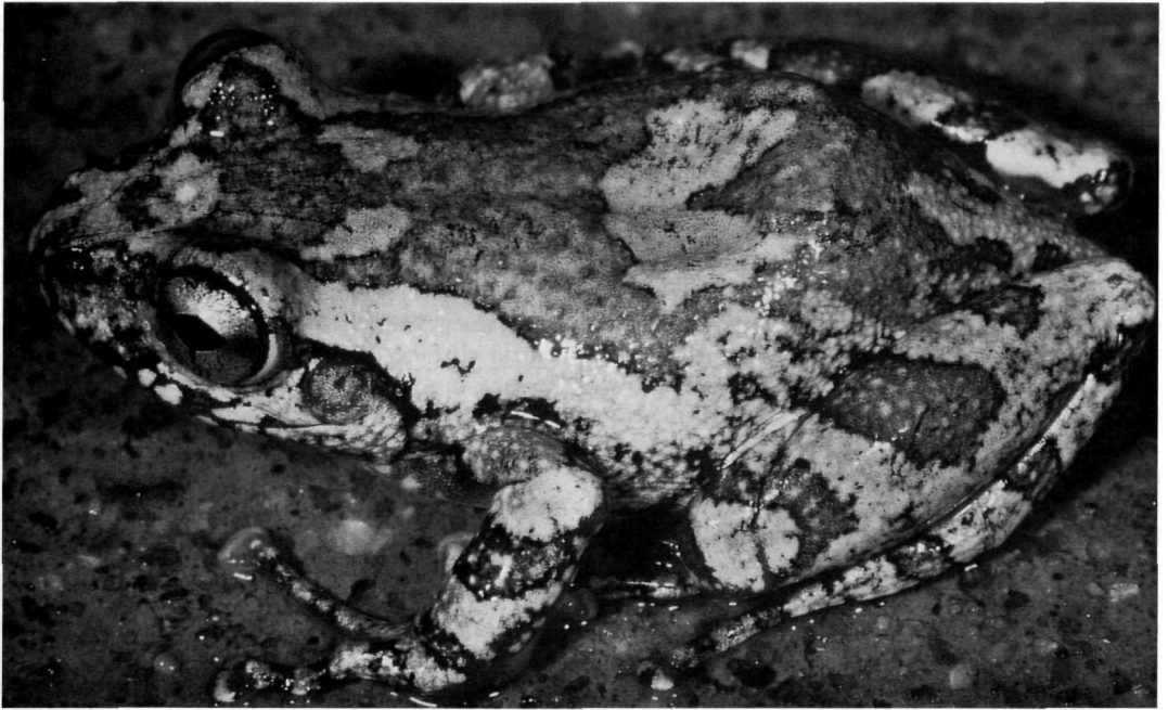
Fig. 1. Boophis xerophilus sp. nov. holotype, dorsolateral view.