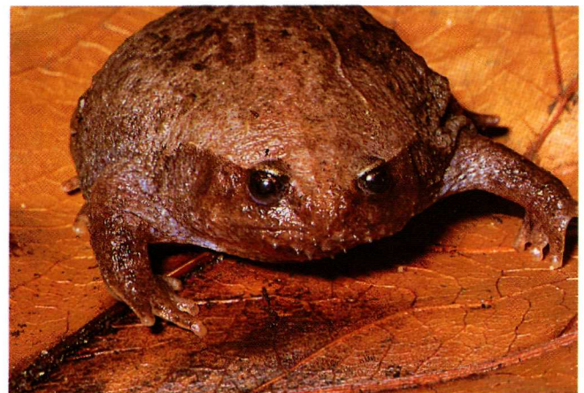
Fig. 1. - Male of Rhombophryne testudo , Nosy Be. Mâle de Rhombophryne testudo , Nosy Be.

Rhombophryne testudo is among the most fossorial Malagasy frogs and shows remarkable morphological adaptations which are probably associated with the burrowing life: barbels on the lower lip, small eyes, depressed body, very short and strong extremities (Fig. 1); only some species of Plethodontohyla have similar adaptations. Little is known about the life history of R. testudo . Calling activity was recognized, especially during heavy rain, from January to April, without concentration around water bodies ( Glaw and Vences 1994). Juvenile specimens captured during rain on the forest floor at Nosy Be in February 1992 had snout-vent lengths (SVL) of 17.8, 18.9 and 23.1 mm. This paper describes the first observations on the reproduction biology of the monotypic genus Rhombophryne .